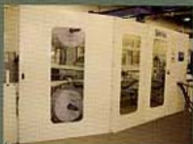
In-Line Two-Seam Paper Bander