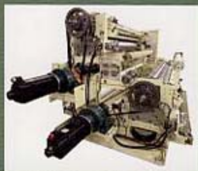
Dual-Station Calender Unit