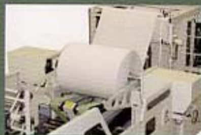
Self-Chucking Core-Ejecting Unwind Stand (Cradle Wrap)