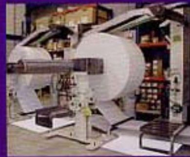
Turret Unwind Stand

3401 Lake Park Road • Ashland, WI 54806 USA • Tel: 715.682.5231 • Fax: 715.682.4138 E-mail: sales@bretting.com • www.bretting.com