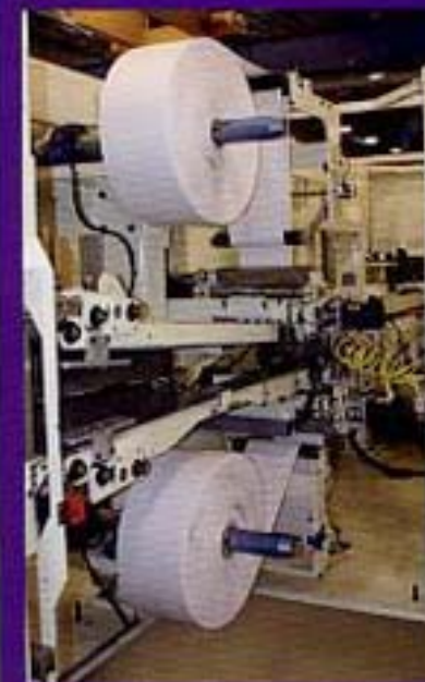
In-Line Two-Seam Paper Bander