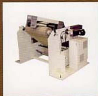
Mandrel Unwind Stand