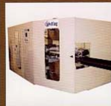
In-Line Two-Seam Paper Bander