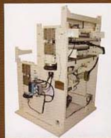
Vertical Dual-Station Embosser