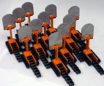
LOG SAW PUSHERS