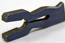
CORE LOCKS AND FINGERS